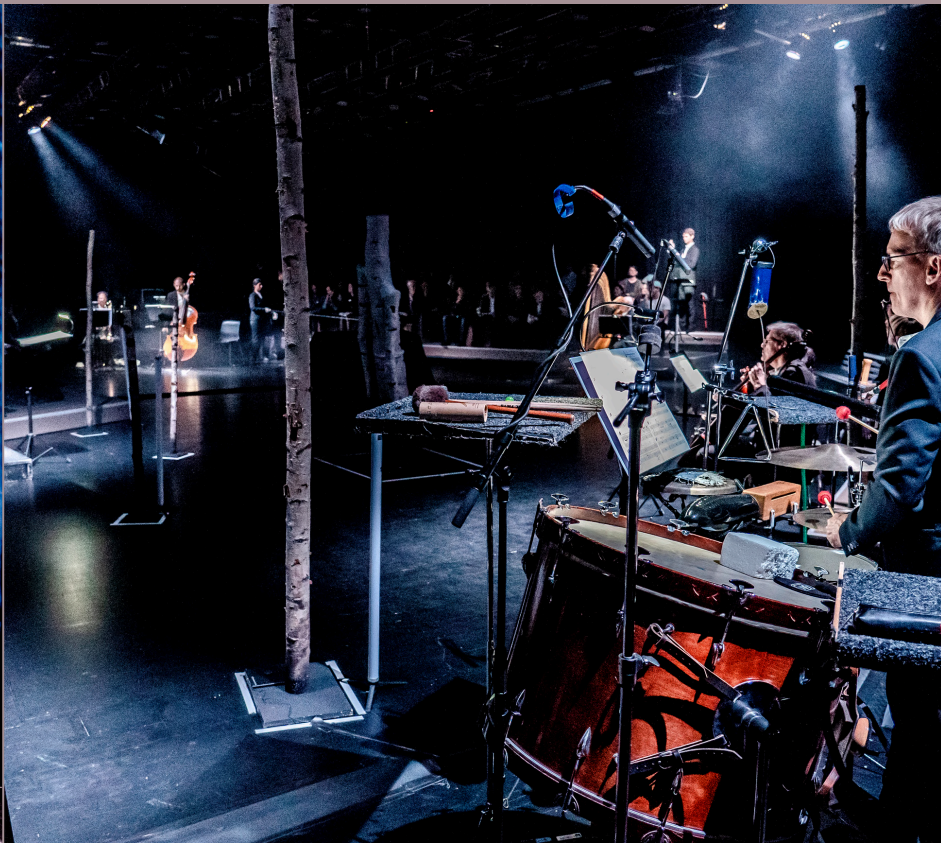
STAGE and LIGHTING DESIGN _Menage á trois new music-theatre 2019