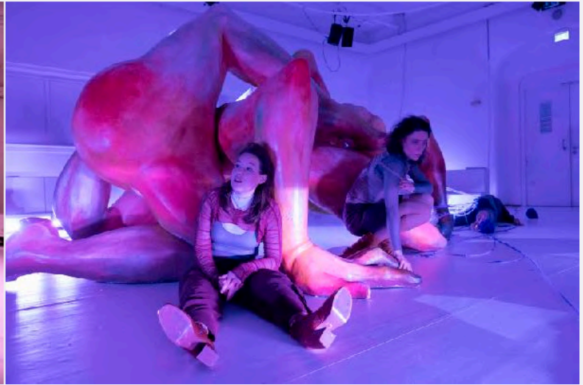
STAGE and LIGHTING DESIGN_Happening by Annie Ernaux 2022