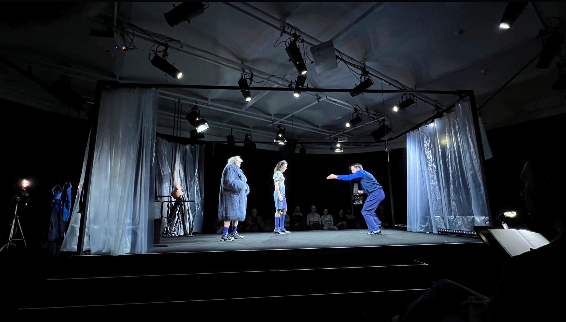
STAGE and LIGHTING DESIGN _ANTIOPE by Jelena Schulte 2024