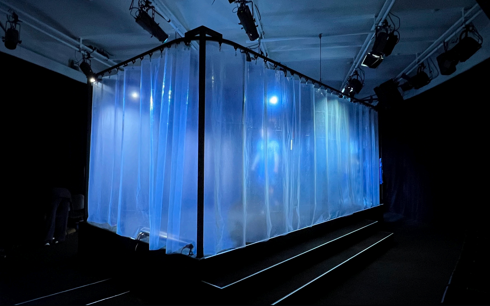
STAGE and LIGHTING DESIGN _ANTIOPE by Jelena Schulte 2024