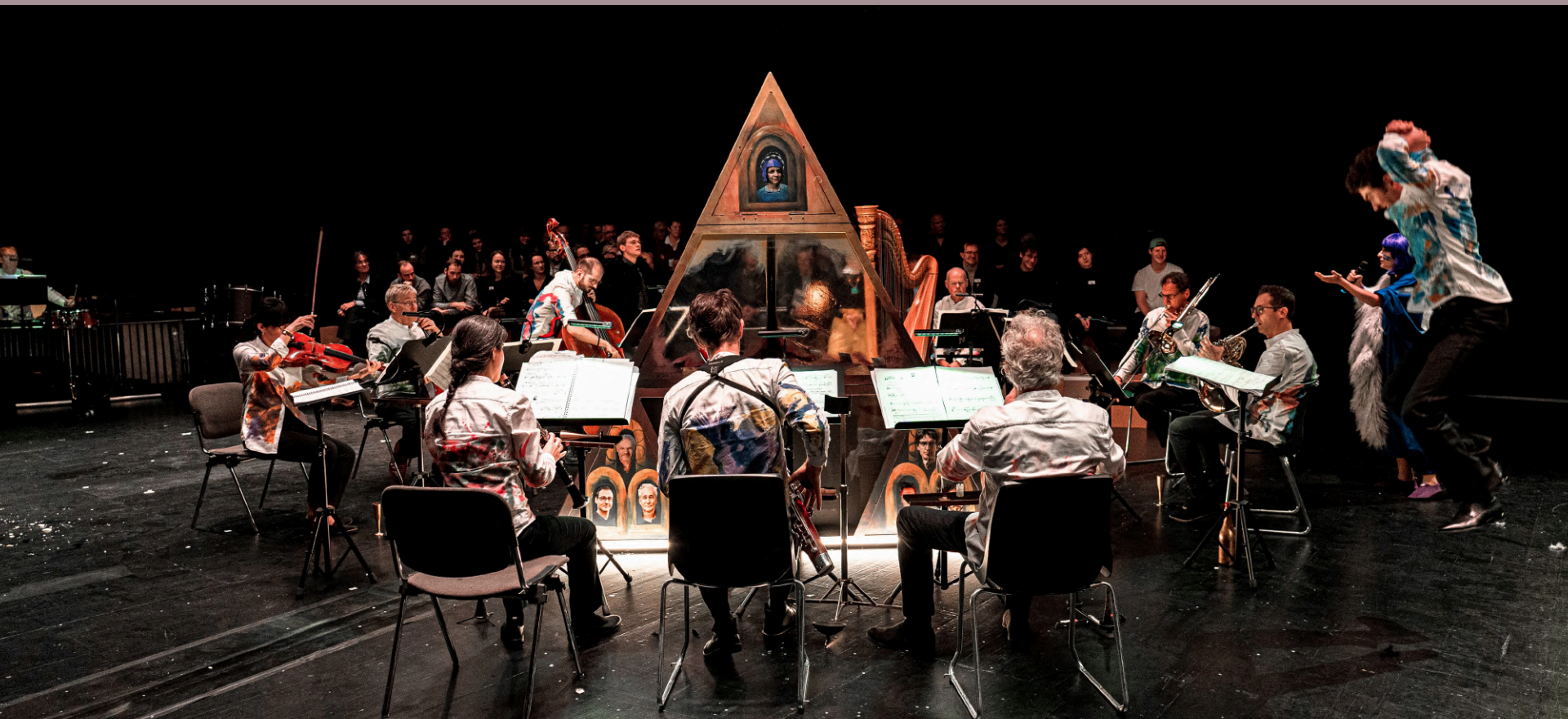
STAGE and LIGHTING DESIGN _Menage á trois new music-theatre 2019