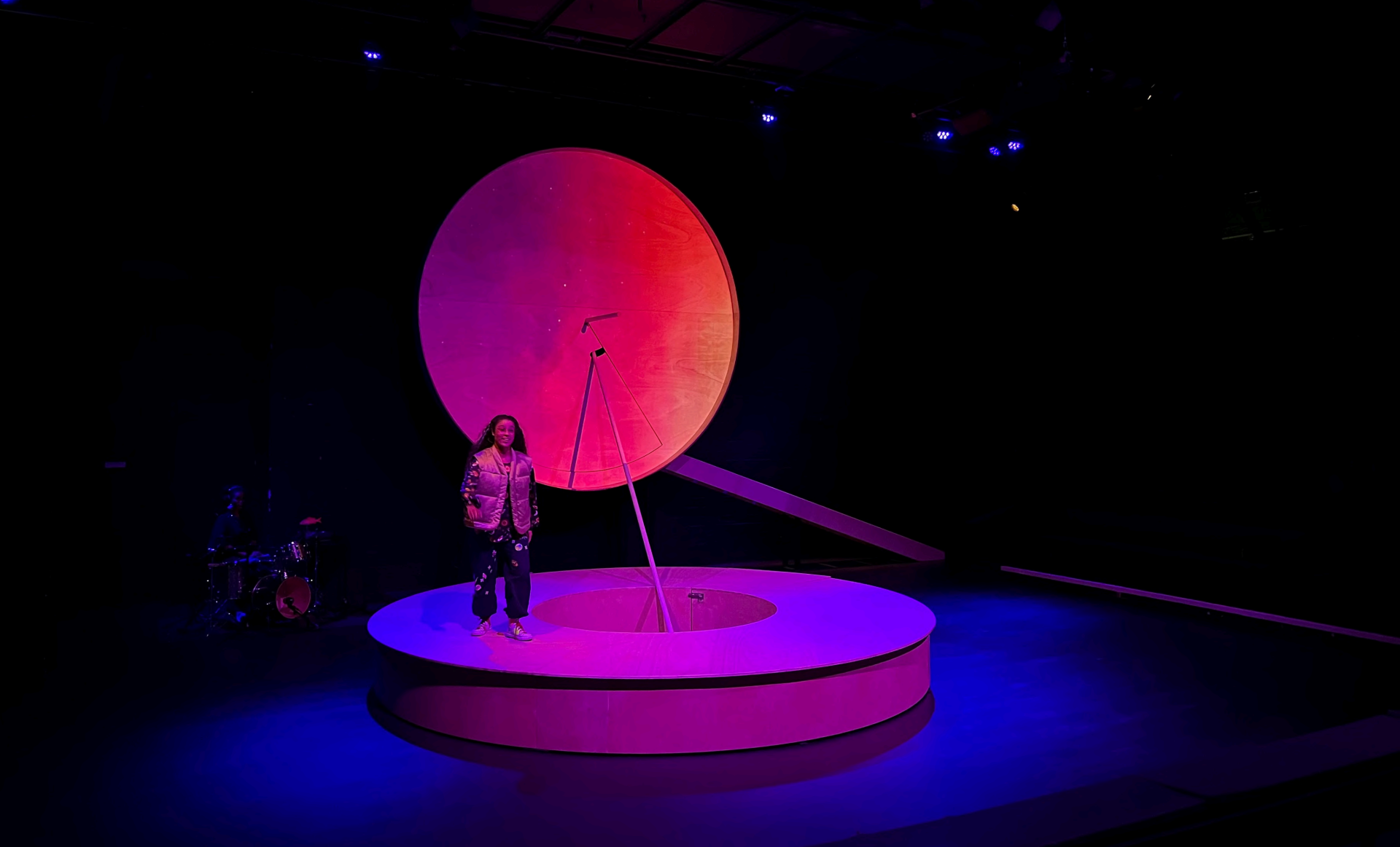
STAGE and COSTUME DESIGN _Woche Woche by Lara Schützsack 2024