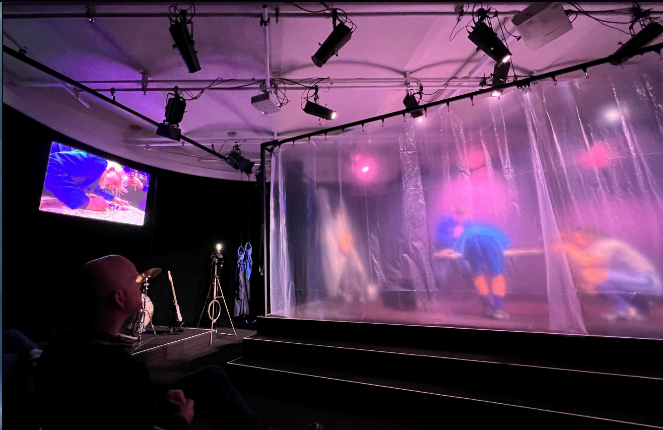
STAGE and LIGHTING DESIGN _ANTIOPE by Jelena Schulte 2024